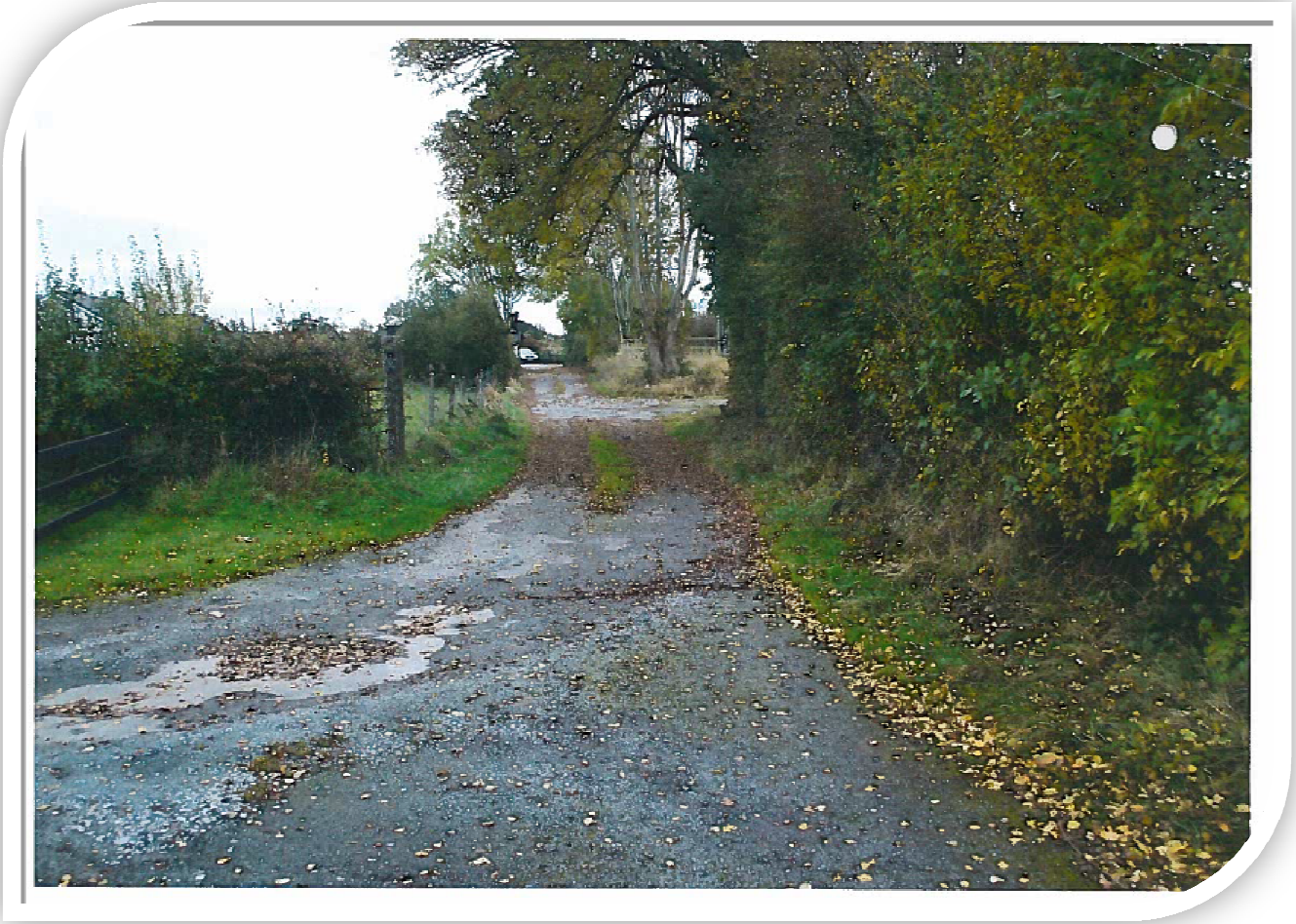
Photographs of Private Road at Taylorstown Cloonown, Athlone, Co. Roscommon